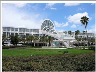
Orange County Convention Center

Did you know....Florida is home to the largest single-building commercial complex in the United States – the Orange County Convention Center in Orlando. This massive facility spans over 7 million square feet and hosts a wide range of conventions, trade shows, and events throughout the year, contributing significantly to the state's tourism and economic growth. 7 million square feet, that's over 121 football and/or soccer fields.